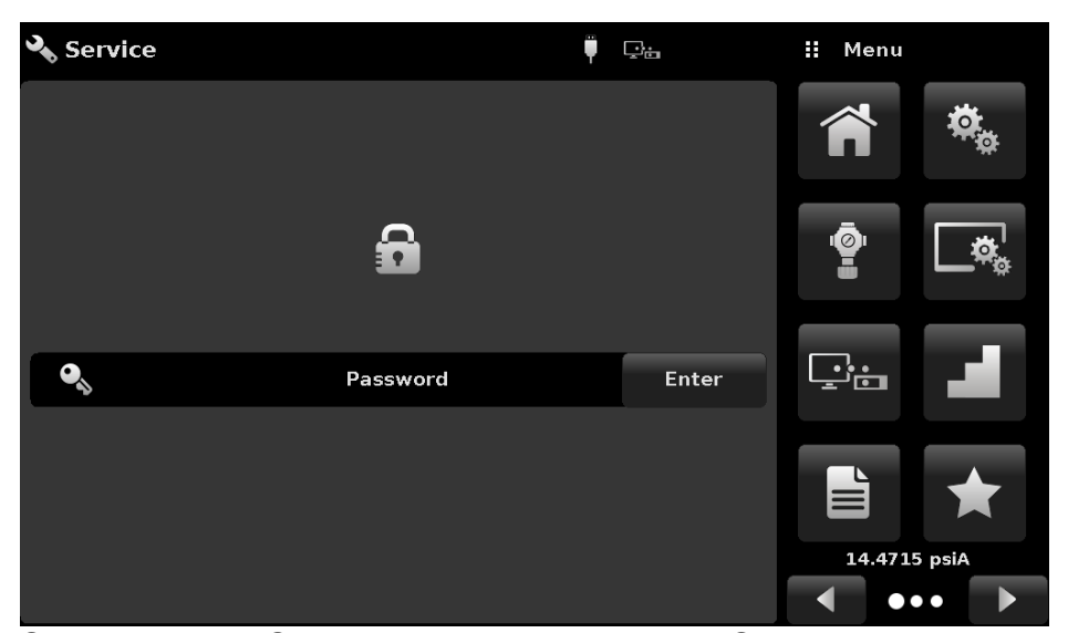
Step 1: Insert USB drive into instrument. A USB icon will appear at the top of the screen.

Where MMmmtt specify the version number of the instrument software.