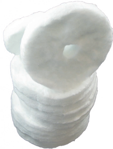
Sealing disc, model SD83